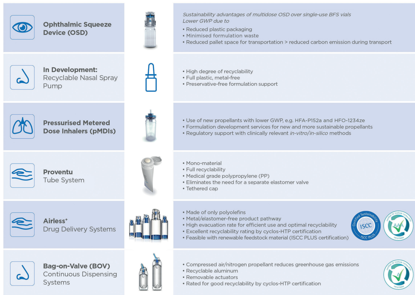
Figure 3: Overview of Aptar Pharma's product solutions, supporting sustainability targets in drug delivery.

common propellants found in similar applications. The BOV systems achieved a "good recyclability" rating (Class A) of the raw packaging assembly from cyclos-HTP.