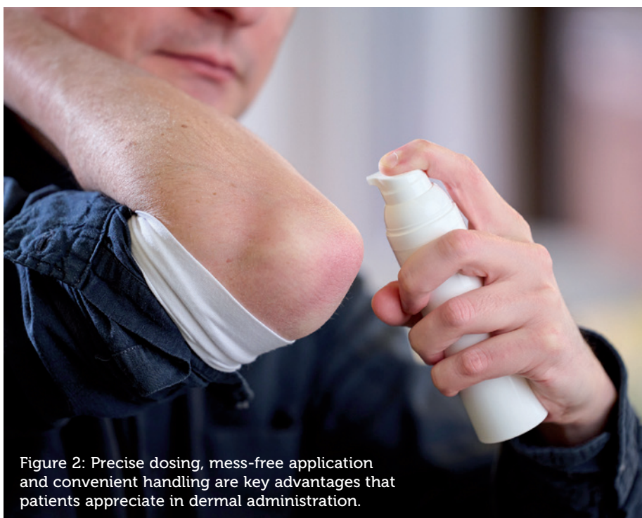
Figure 2: Precise dosing, mess-free application and convenient handling are key advantages that patients appreciate in dermal administration.

A Yes, patients and users have also started to discover the benefits of airless packaging systems, citing features such as ease of use and clean dose delivery as attractive benefits (Figure 2). Airless packaging can also extend the lifespan of a product, and the efficiency of the dispensing system means there is minimal waste of valuable product formulation. Another functional benefit of airless packaging systems is that their leak-resistant properties improve their portability, allowing them to be safely carried in a handbag or backpack. Patients can self-administer a precise dose of semi-solid