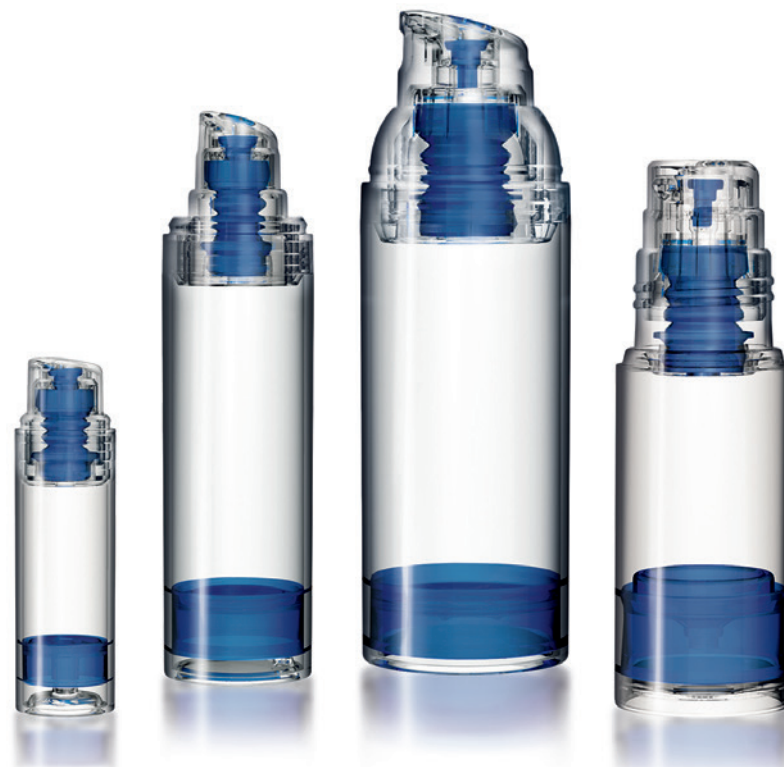
Figure 3: Dermal drug delivery is an important area of focus for Aptar Pharma with its Airless + packaging systems.

A While there are a number of airless packaging providers out there, Aptar Pharma's offering is different in that we can offer a full, integrated package of services. Our customers know that we have proven successes supporting customer approvals using our Airless + systems with a range of regulators. We have also started to create dossiers and drug master files with relevant authorities to accelerate the process further. Aptar Pharma's airless systems have been used in more than 50 commercially marketed drug products.