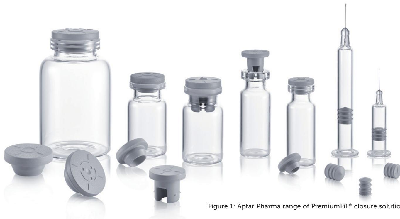
Figure 1: Aptar Pharma range of PremiumFill® closure solutions.

manufacturing and pharma grade processes, is an ideal partner to support drug manufacturers in this crucial aspect of drug development.