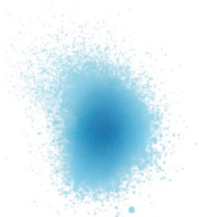
Standard spray pattern