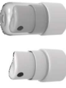
CAP PKA ROBIN (CB)