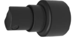
CLOSURE (SMOOTH): 20/410 MATT 24/410 MATT