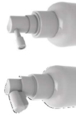
NOZZLER + SAFETY CLIP