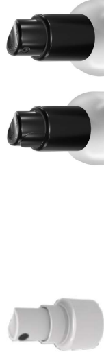
PSK / PZ CLASSIC