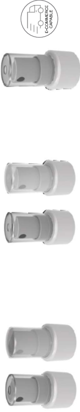
CAP PKA 22